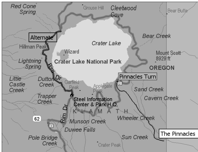
Alternate Route Partial Profile