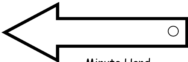
Minute Hand - Color Red